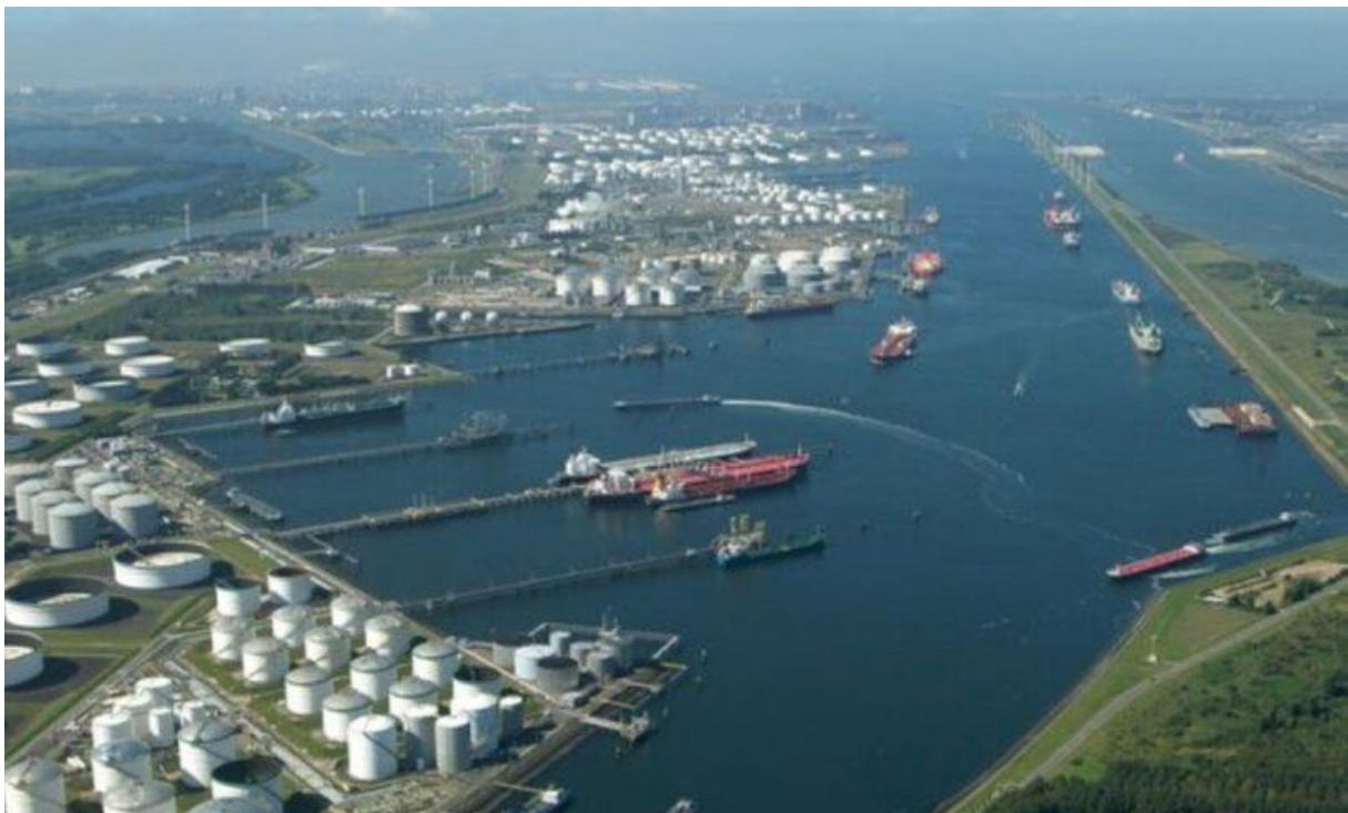
Port of Rotterdam

With two weeks until its implementation, analysts at Clarksons Research have produced data to show the costs of the European Union Emissions Trading Scheme (EU ETS) for VLCCs, MRs, capesizes and panamaxs.