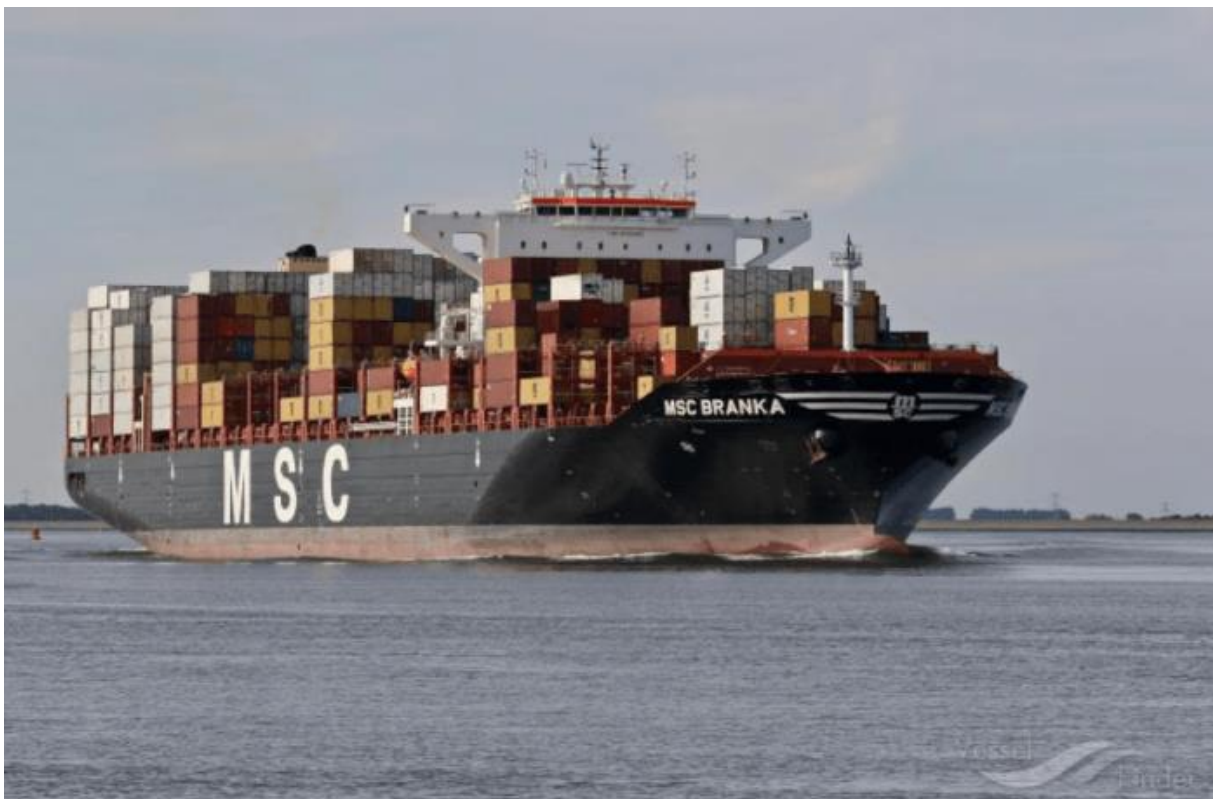
MSC Branka

Aiming to improve its Europe - South Africa network, MSC has announced the enhancement of its NWC to South Africa Service, effective from March, and the launch of a new feeder service in the area.