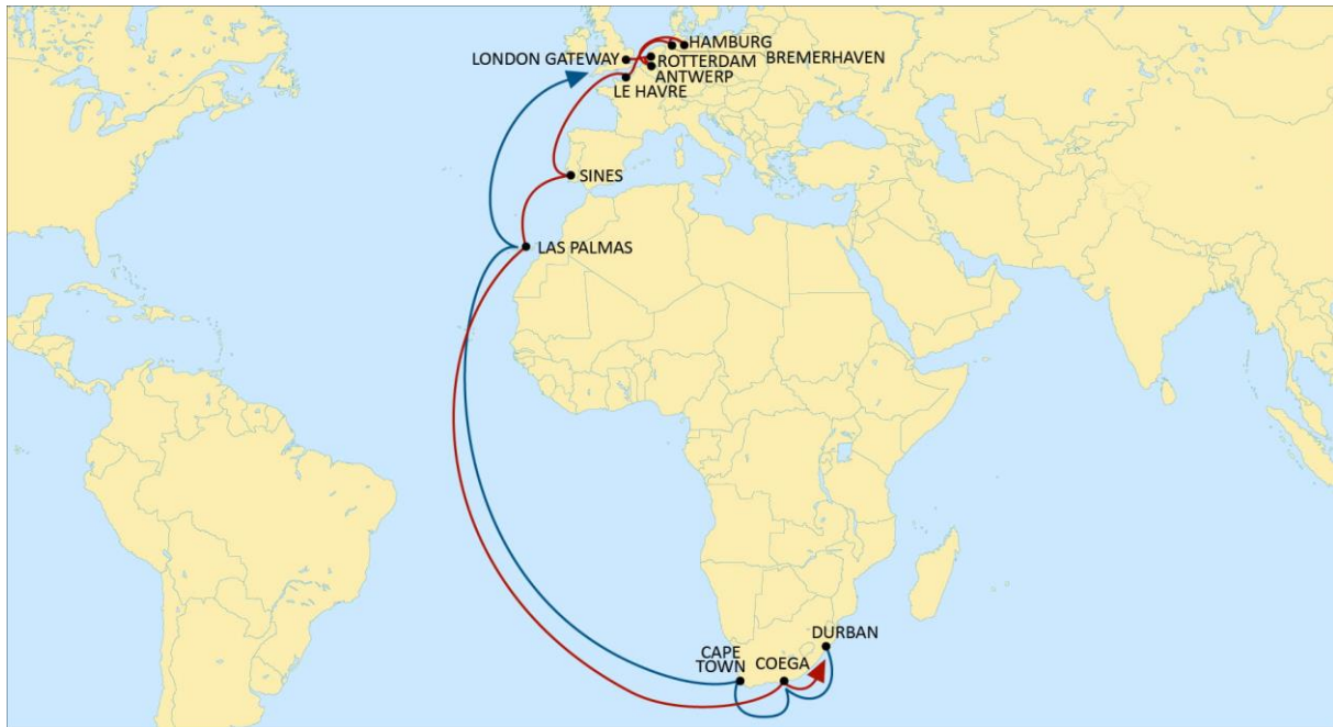
MSC's NWC to South Africa Service port rotation map

The 2016-built container ship MSC Branka will be deployed on the maiden voyage of the revised rotation. The vessel is scheduled to arrive in Bremerhaven on 19 March.