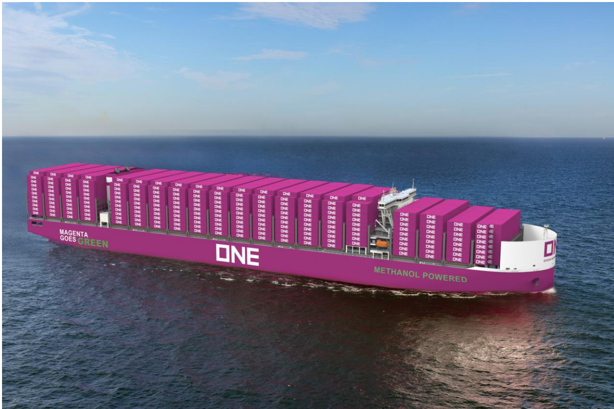
Joint design image by Yangzijiang Shipbuilding representing 6 of the vessels

These vessels are designed with capabilities to be flexible and agile which will seamlessly integrate into ONE's evolving and dynamic global network. This investment and purchase are aligned with ONE's stringent procurement policy aimed at meeting customer demand and being adaptable for any future change in global sustainable supply chains.