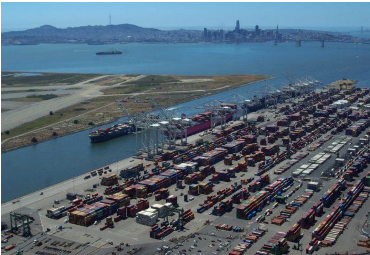
Port of Oakland

Container volume at the Port of Oakland surged in February, surpassing the volume recorded in the same month last year.