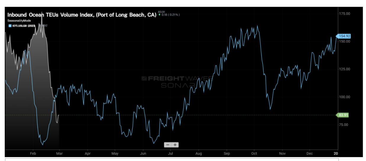
FreightWaves SONAR, Inbound Ocean TEUs Volume Index for the Port of Long Beach, 2024 (white) and 2023 (blue)

The later Lunar New Year celebrations, starting Feb. 10 in 2024 compared to Jan. 22 in 2023, likely mean that the pull forward that drove growth in January will also help import figures in February.