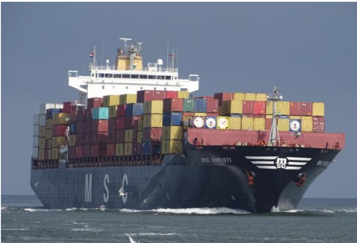
MSC Shristi

Swiss/Italian container line MSC is launching a new shuttle service, Dhalia, to provide additional capacity for Asia to Mexico West Coast routes.