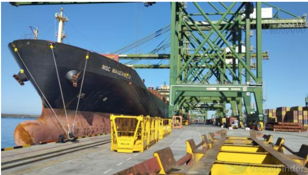
MSC Manzanillo

MSC will revise its former standalone Türkiye/West Med to the United States service. Renamed EMUSA, the new set up will connect Mediterranean and US trade by adding direct coverage from Barcelona, Spain and Fos-sur-Mer, France.