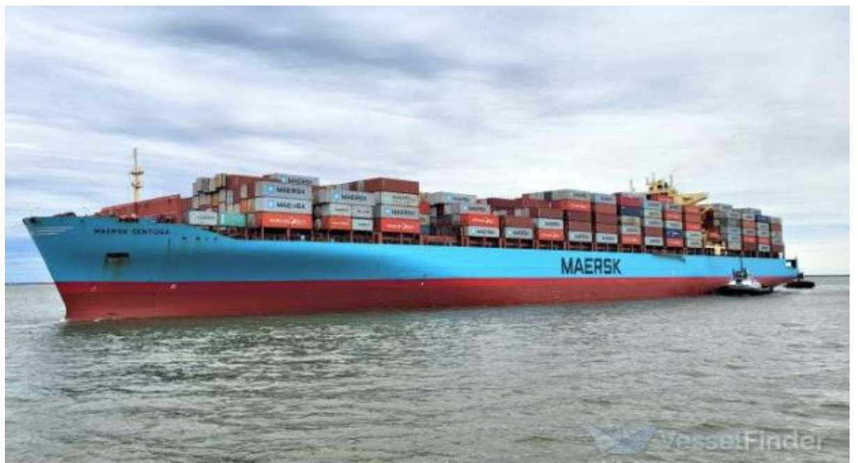
Maersk Sentosa

Maersk Line has confirmed that Houthi rebels have attacked another of its US-flagged ships. The 2007-built 6,648 TEU Maersk Sentosa was hit by missiles while underway in the Arabian Sea.