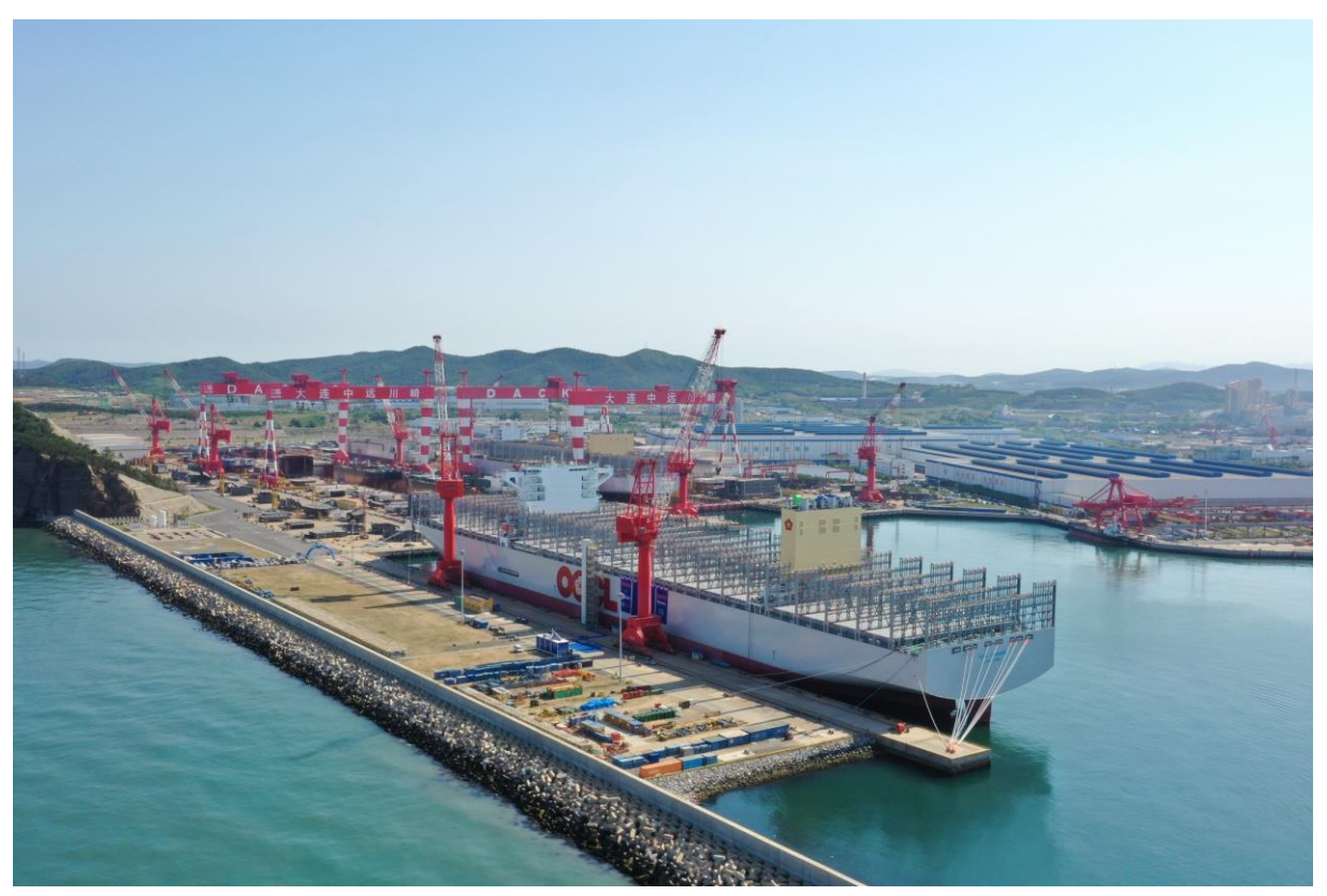
(Image 1 & 2) The naming ceremony of OOCL Denmark was successfully held on June 25.