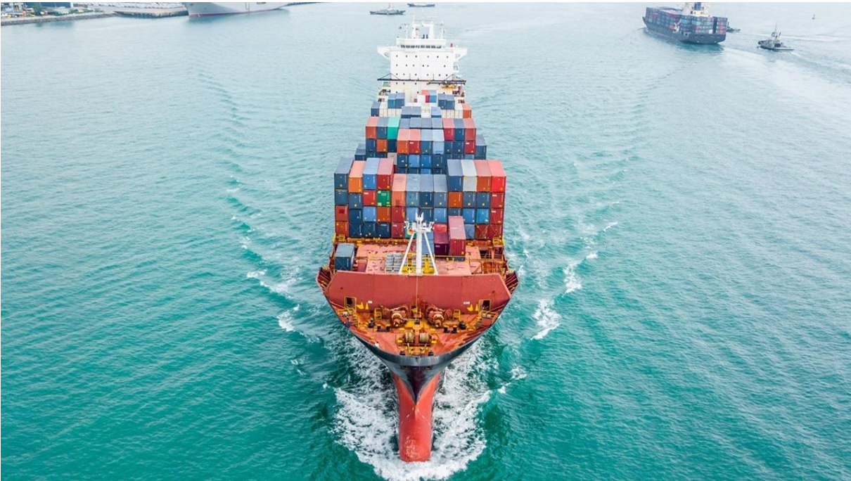
File photo of a container ship

Both global line Ocean Network Express (ONE) and regional player SeaLead have announced new services calling at ports in, or at the entrance to, the Red Sea.