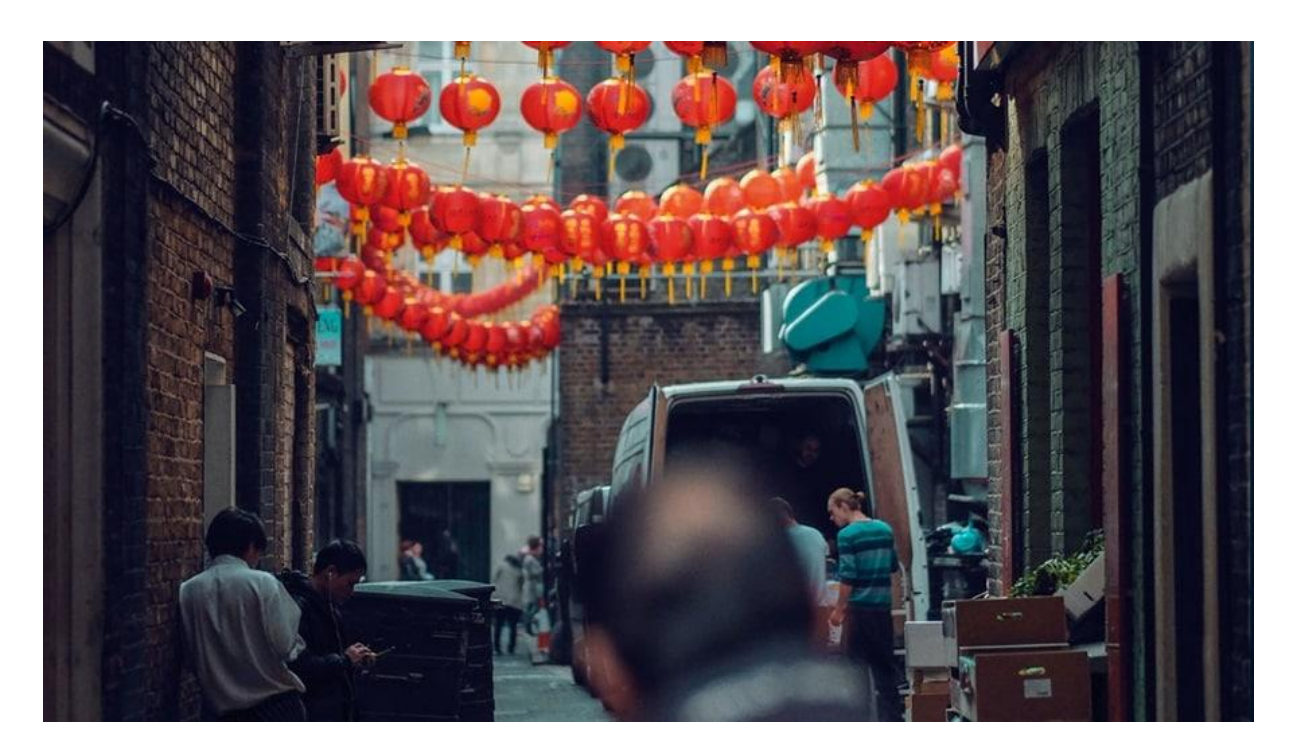
What is Chinese new year?

Chinese New Year is also known as the Spring Festival, is one of the most important holidays in Chinese culture. It marks the beginning of the new year according to the traditional Chinese lunisolar calendar. The celebrations start with the new moon between end of January and last until the Lantern Festival, which is held on the 15th day of the new year. This holiday is rich in traditions and customs including family reunions, feasting, giving red envelopes, and various cultural performances such as lion and dragon dances.