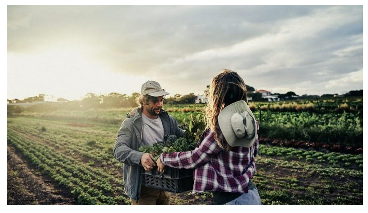
Do not rely on a single provider : Diversifying your supplier base is a key strategy to ensure supply chain resilience. Relying on a single provider can be risky, especially during peak holiday seasons.

Anticipate shipping delays and plan in advance: Shipping delays are common during Chinese New Year due to the high volume of shipments and the closure of factories and ports. To avoid these delays, plan your shipments well in advance. Work closely with your logistics partners to schedule shipments early and consider using expedited shipping options if necessary.