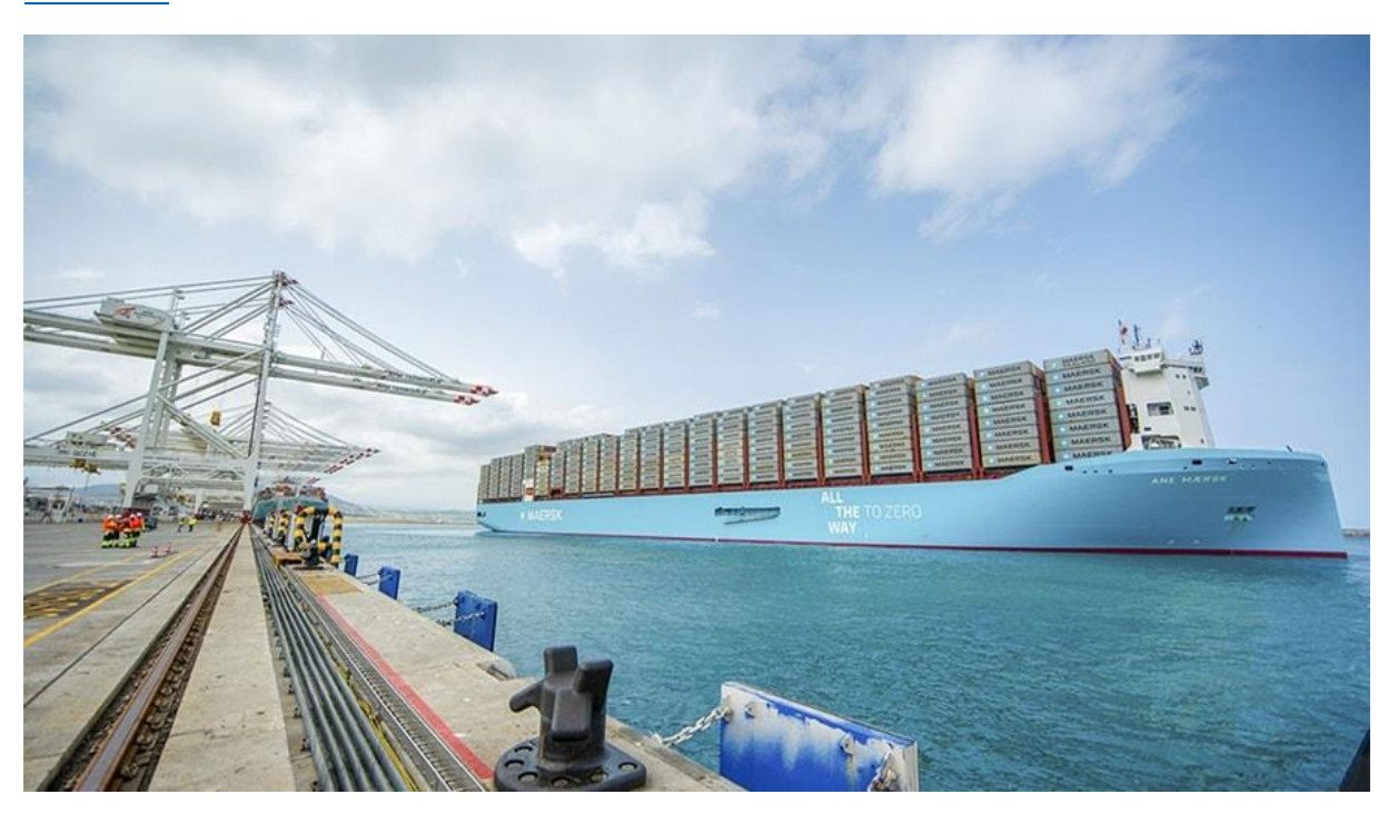
Maersk and Hapag-Lloyd announce two ocean network options with equal industry-leading schedule reliability