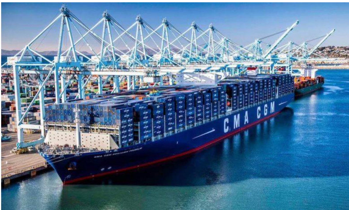
Port of Los Angeles

CMA CGM has overhauled Maersk to become the largest carrier on the transpacific.