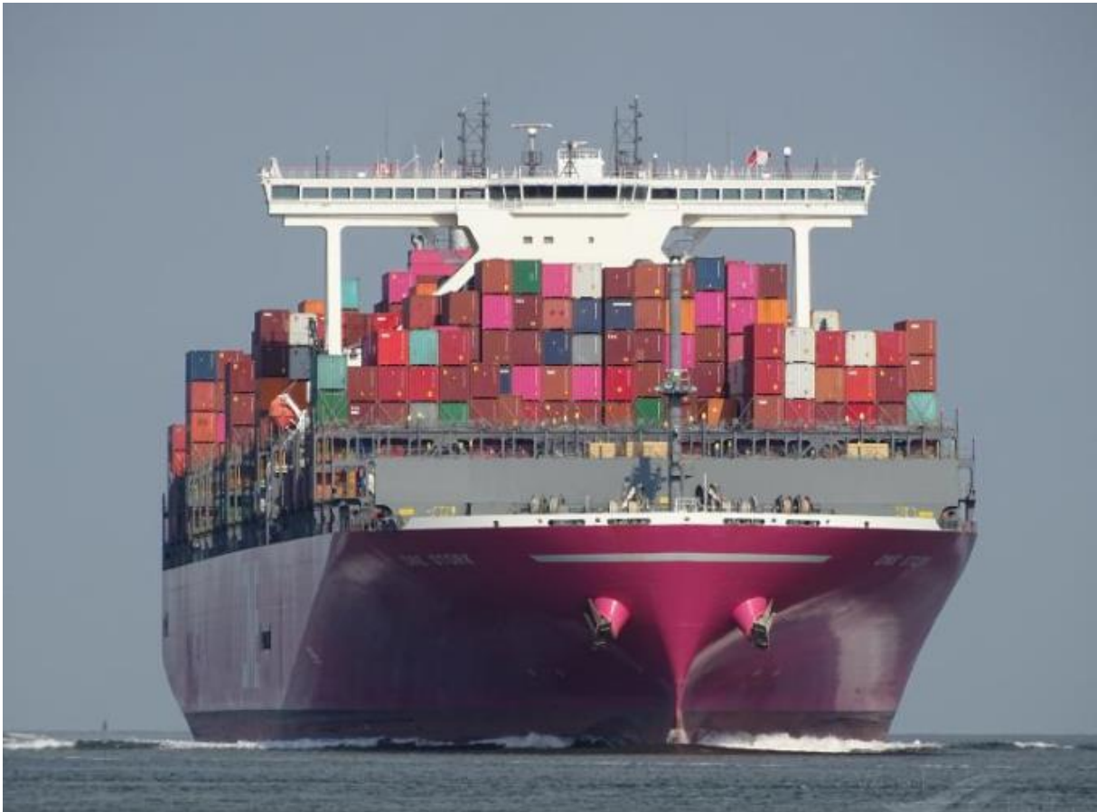
ONE Stork

Singapore-headquartered box carrier Ocean Network Express (ONE) and South Korea's flagship container line HMM will launch a new service connecting key ports in the Far East with major hubs on the East Coast of South America.